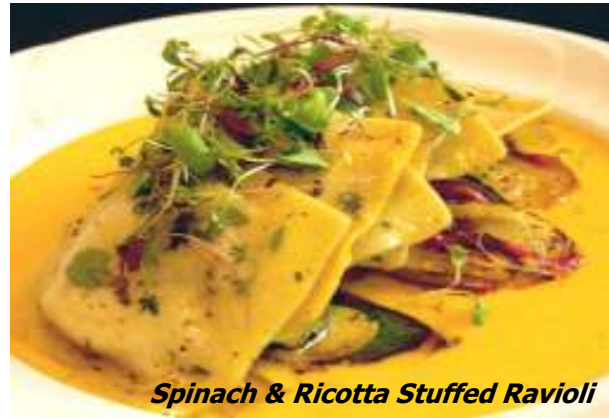
Spinach & Ricotta Stuffed Ravioli

Rich Langoustine Lobster Meat in Combination with a Lobster Cream Sauce, Medley of Mushrooms & Asiago Cheese 17.95