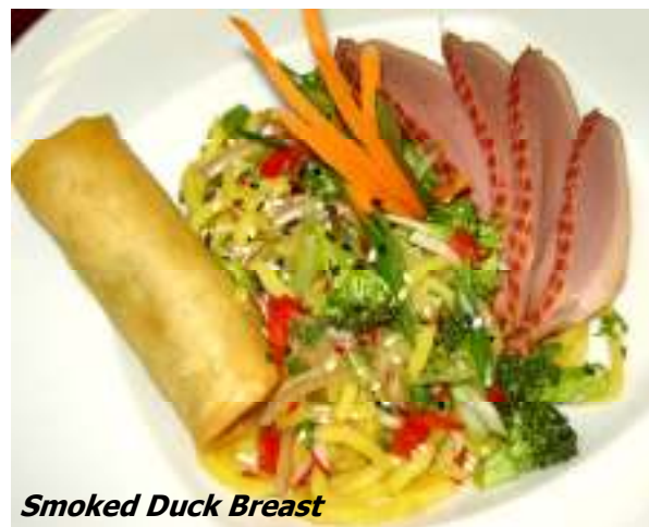
Smoked Duck Breast

Served with Asian Style Noodle Salad & Vegetable Spring Roll 8.95