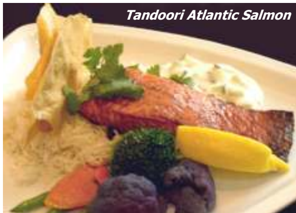
Tandoori Atlantic Salmon