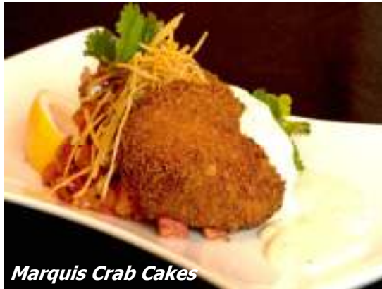
Marquis Crab Cakes